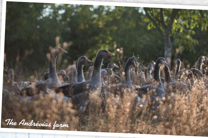
The Andrévias farm

Here the specialties are goose preparations, but there is also a walnuts grove of 10 hectares. The main goal of this farm is to maintain family know-how and traditions and to highlight the exceptional quality of goose foie gras.