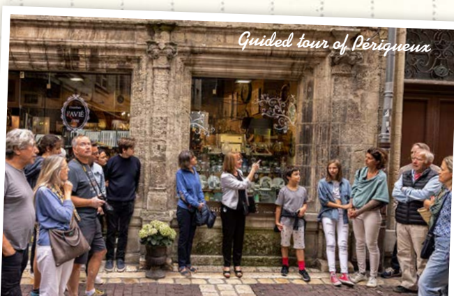
Guided tour of Périgueux

Périgueux was born in 1240 from the union of two geographically and politically opposed urban centers: the city of Petrocores to the west and the town of Puy Saint-Front to the east.