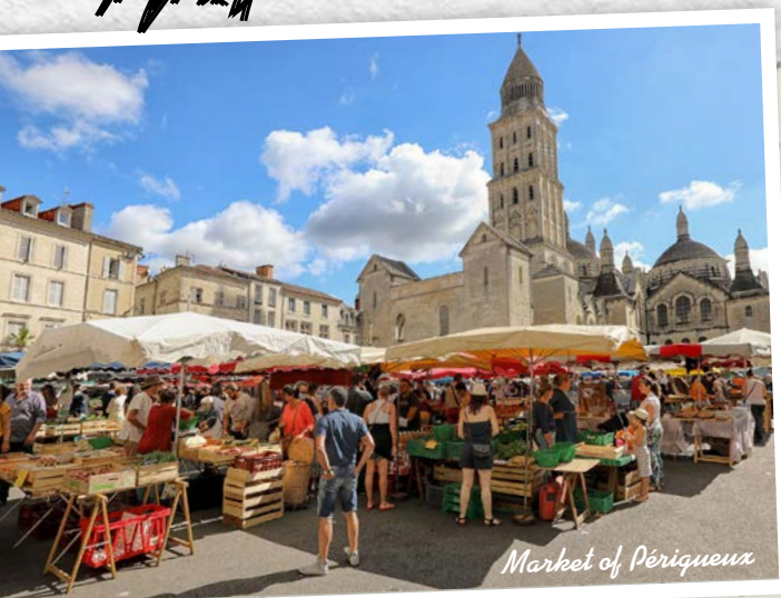
Market of Périgueux