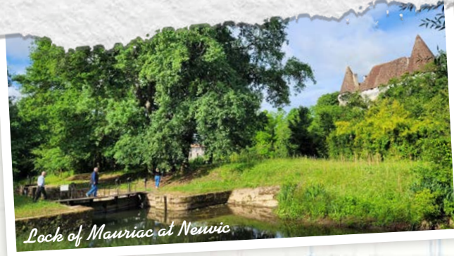
Lock of Mauriac at Neuvic

Start your discovery of the Isle Valley , its history, culture and gastronomy! With castles, abbeys, priories and museums , a large variety of discoveries are offered in an authentic natural environment .