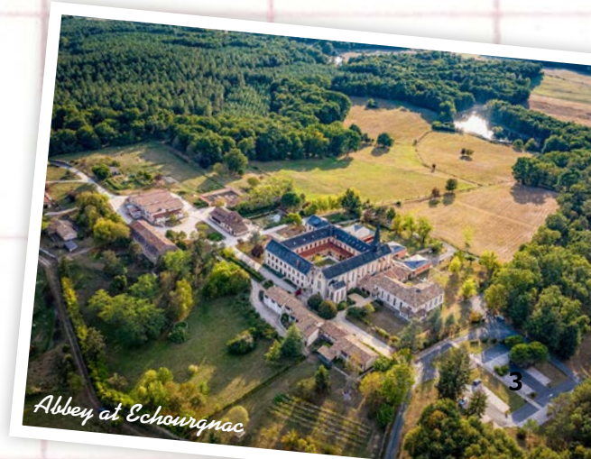
Abbey at Schourgnac