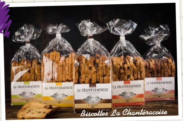
Biscottes La Chanteracoise

In the village of Saint-Germain du Salembre you find La Chanteracoise , the last traditional cookies factory in France. Here in the shop and workshop, you will learn about the history and how these delicious cookies are made.