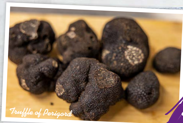
Truffle of Périgord

Guided tours are offered to groups all year round by appointment. You can also participate in tasting sessions and demonstrations of «cavage» (truffle hunting) in the season.