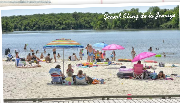
Grand Etang de la Jemaye