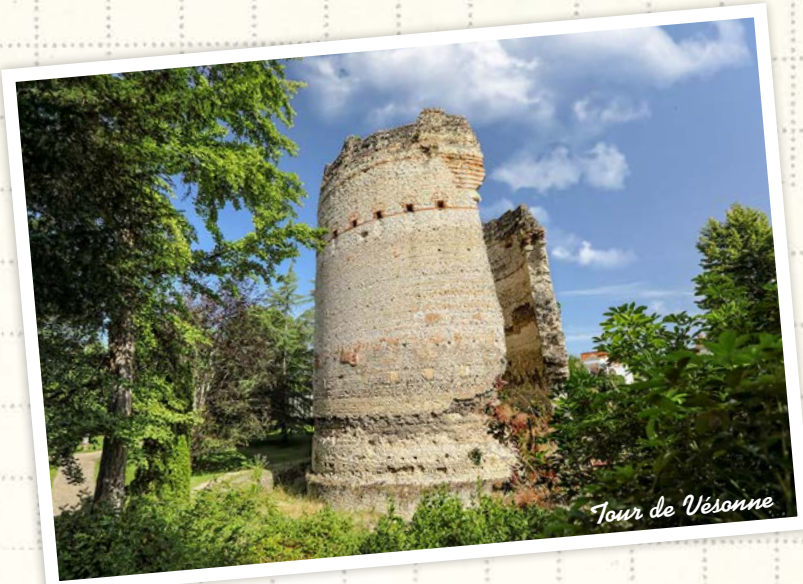
Tour de Vézonne

Accept to be guided and discover in a privileged way the history of Périgueux and urban walks.