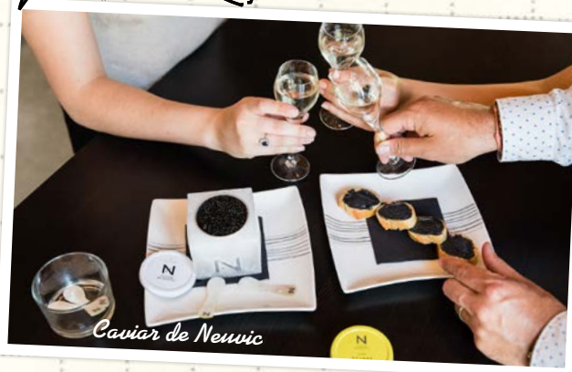
Caviar de Neuvic

A must see : for epicureans, the Caviar de Neuvic , invites you to discover the sturgeon. Discover the precise and precious gestures that allow the elaboration of caviar before a tasting! Several options for a visit are offered all year round upon reservation, to discover the caviar and the breeding farm.