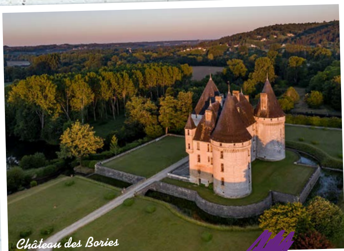
Château des Bories